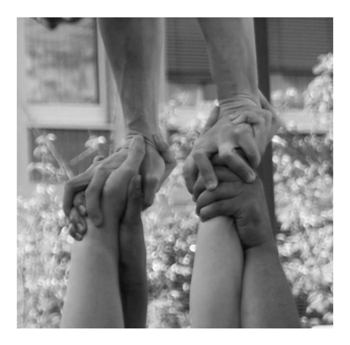
Three (working title)

A choreographic indulgence celebrating and exploring the expressions and impressions that appear when three strong women move, lift and balance each other