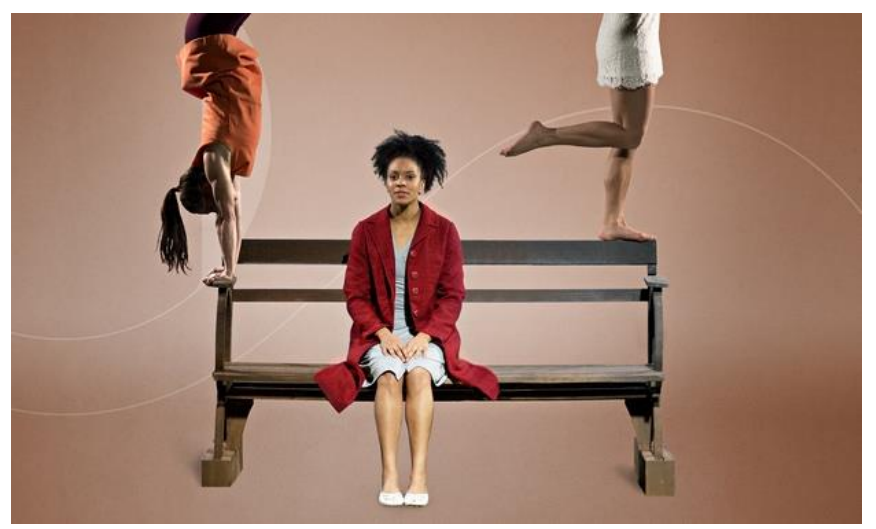
The Bench.