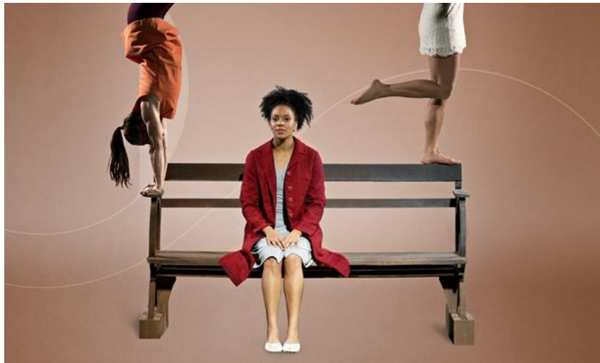
The Bench.