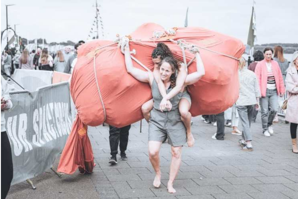
Carnival of Colours