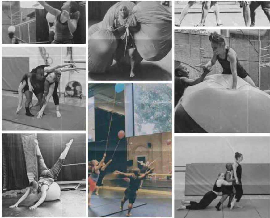
Research & Development images

Weight(less) was created through 2023 and 2024.