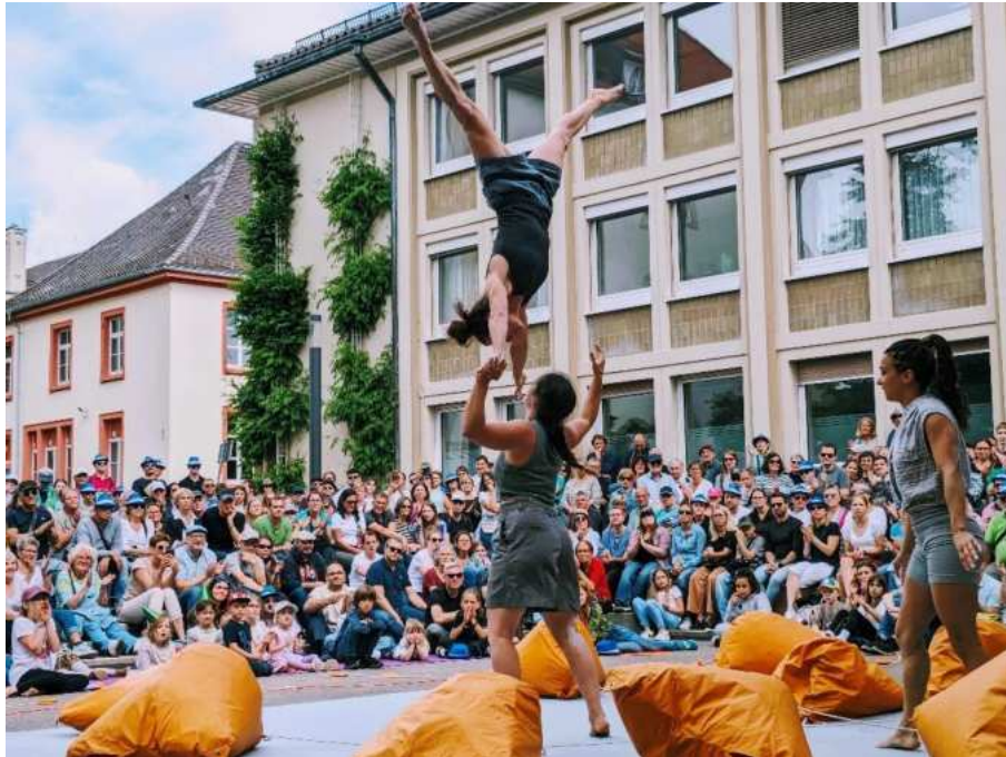
tête-à-tête festival, Rastatt, Germany

We gathered feedback through a variety of methods including in person and using feedback cards at the performances themselves, through the Arts Council-supported Impact & Insight Toolkit, and through social media comments. All of the feedback can be read in the appendix, and here are some highlights.