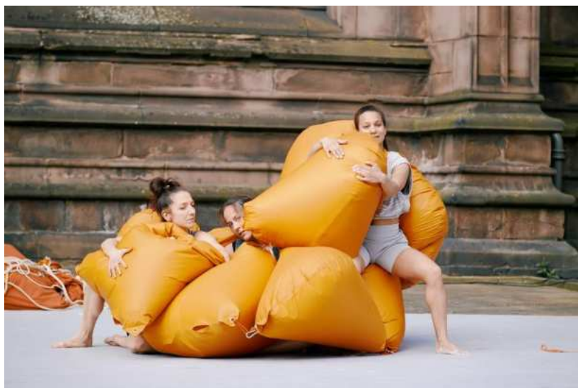
WOW Rotherham

100% of respondents said their experience was excellent.