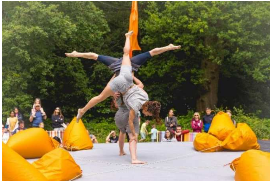
Creative Crawley

WOW Rotherham: “I’ve come down, I sat here and I just thought you know what I’ll give it a whirl, I’ve never seen outdoor artists before, but it’ was amazing, I don’t know if you’ll understand this, but it has kind of changed my life, erm, I never thought you could dictated words through movement but, I can’t say any more than that... It were amazing, absolutely amazing, and it’s kind of made me feel something I’ve not felt ever. I never thought I could understand something like this, and that’s why I sat down, but when I saw it, I felt the pain, I felt the feelings, I felt everything, and it kind of made me want to cry in a sense. I said to the performers absolutely bloody amazing, and I’ve never ever thought I could like something like that, but God bless you. Absolutely amazing.”