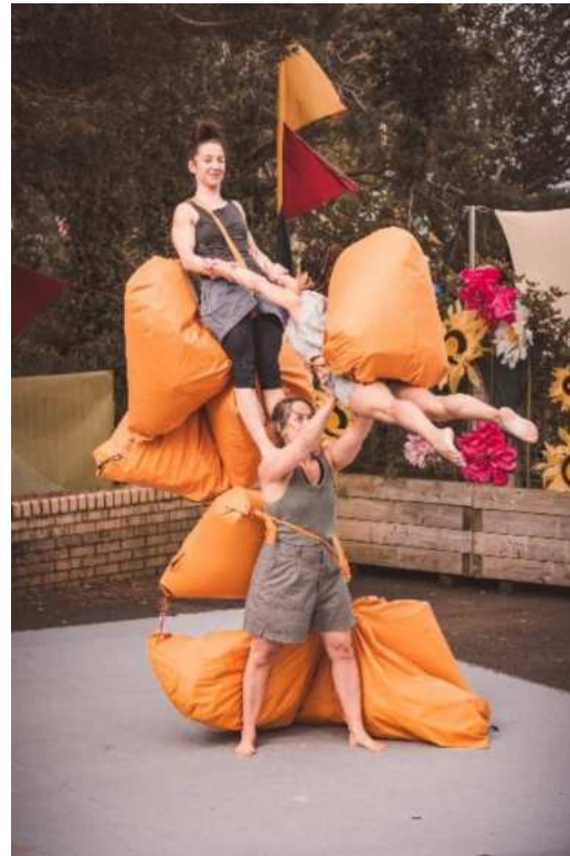
Carnival of Colours, Derry