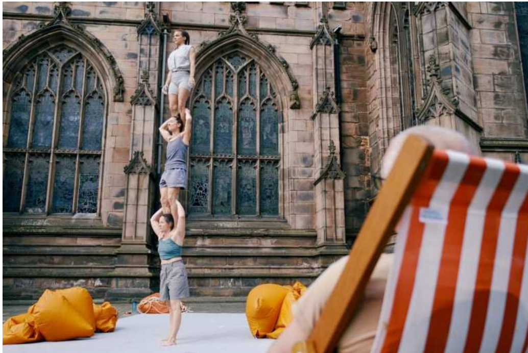
WOW Rotherham

Mimbre is a female-led company creating delicate, breathtaking and highly-skilled acrobatic theatre in outdoor and unusual settings. For over 25 years, Mimbre has captivated worldwide audiences, using innovative circus and movement as a physical language to illuminate human connections.