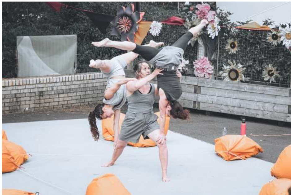
Carnival of Colours, Derry, image by Joseph Gerard

(All of these numbers were reported to the Arts Council's Illuminate database 2 )